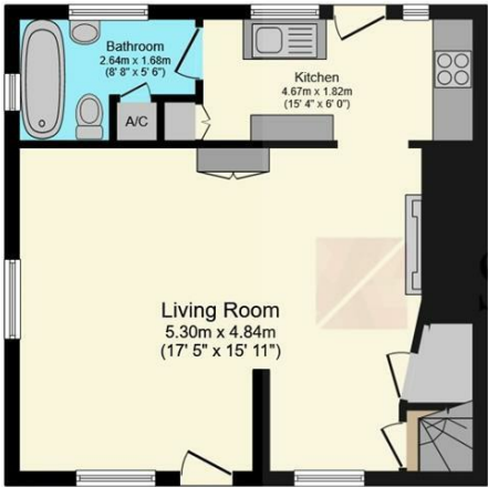
Ground Floor Floor area 45.8 sq.m. (493 sq.ft.)