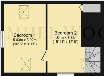
First Floor Floor area 32.8 sq.m. (353 sq.ft.)